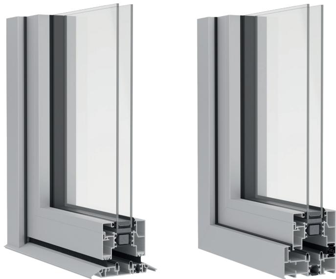
LOW THRESHOLD option

Possibilities From simple open-in doors to configurations of up to 14 sashes, this aluminium bi-folding door system adapts to a wide range of architectural projects.