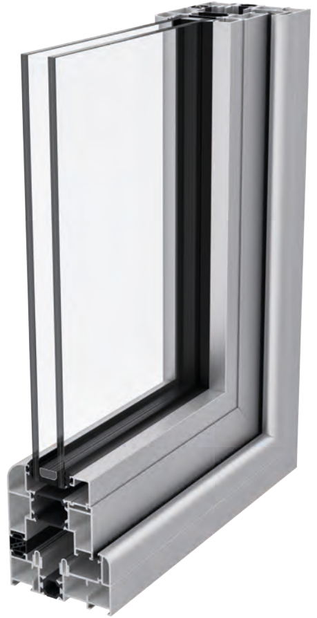
Option ROUNDED DESIGN