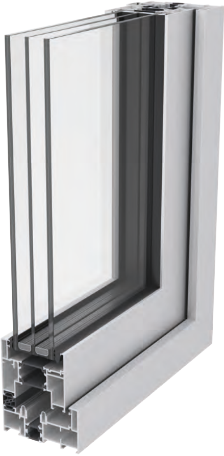
Option SQUARE DESIGN