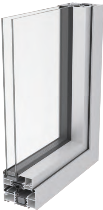
Option SLIM SASH / FLUSH